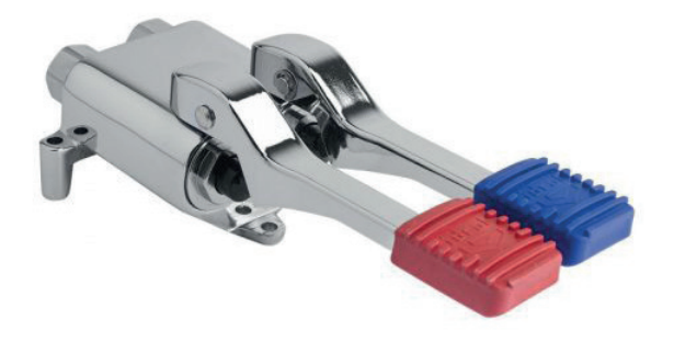
02066 Floor mounted double pedal mixer