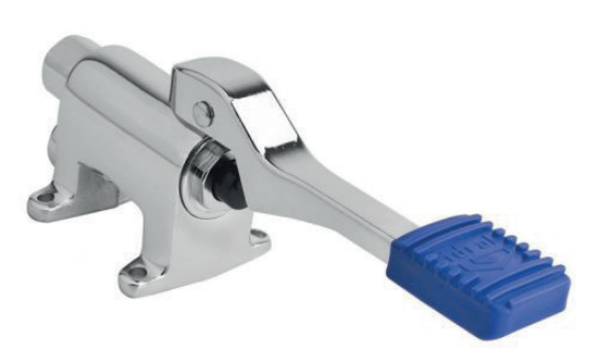
02061 Floor mounted pedal tap