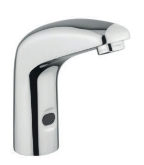
02511 - ONE series electronic basin tap with infrared sensor.