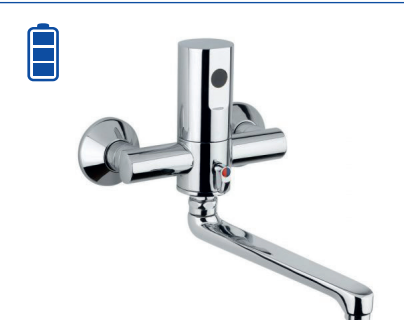
02552 - ONE series wall mounted electronic basin/sink mixer with infrared sensor and swivel spout.