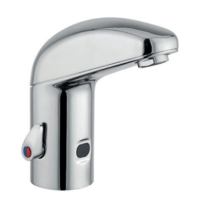
02512 - ONE series electronic basin mixer with infrared sensor.